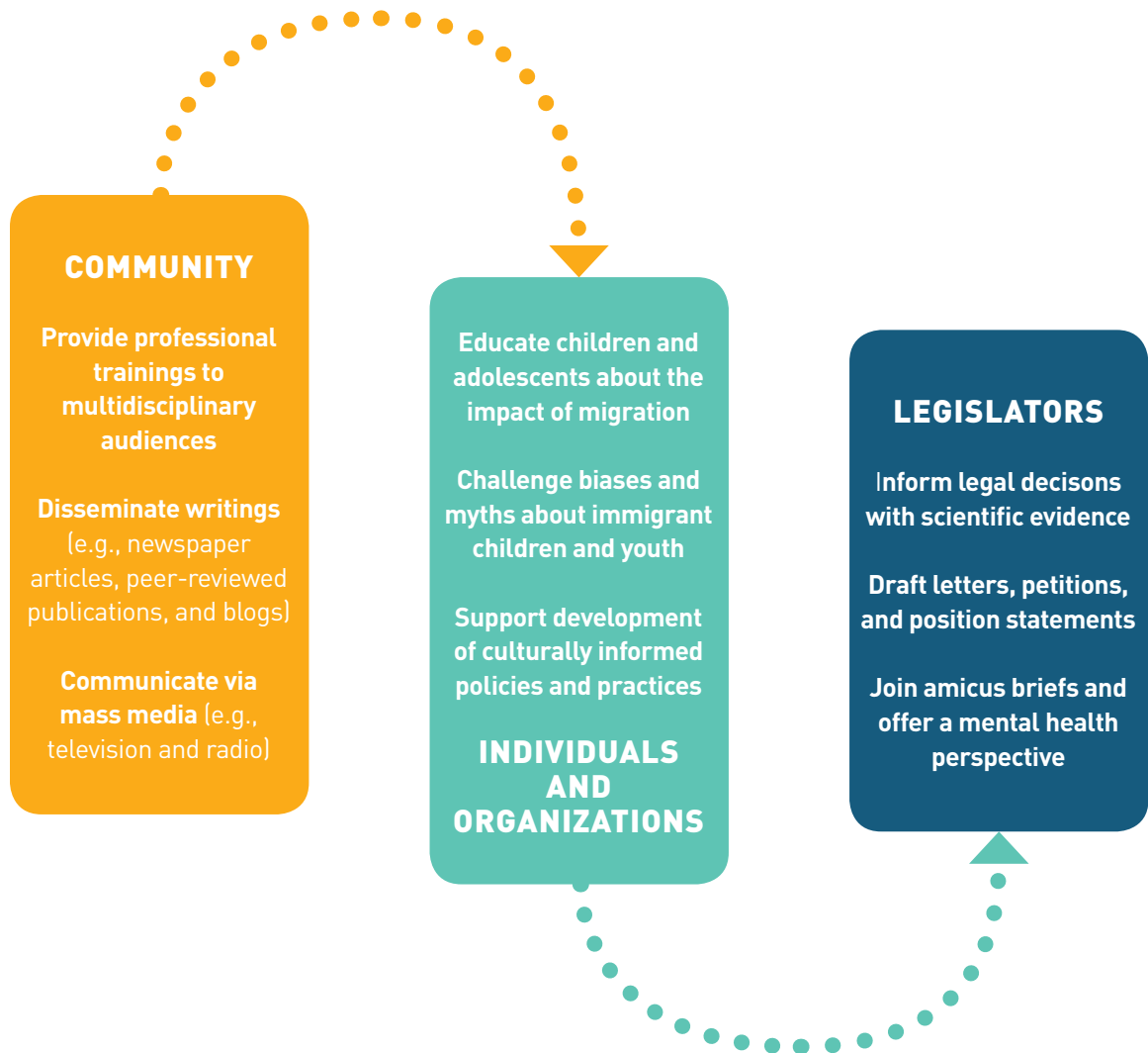
Figure 3. Education as a means of multi-level social justice advocacy.

p, 685). In particular, mental health professionals can shed light on the special needs of indigenous, ethnically diverse, and LGBTQ youth who often get lost in a “one size fits all” mentality and generic policies designed for immigrant children. Training regarding immigration remedies available for unaccompanied children is essential to access “protection from deportation and the ability to live, work, and heal under the protection of U.S. family court and immigration laws” (Fitzpatrick & Orloff, 2016, p. 685).