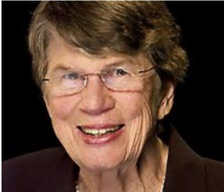
Former Attorney General Janet Reno