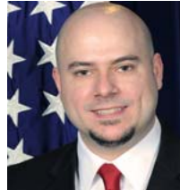
Andrew Robert Lorenzen-Strait Public Advocate

Promote homeland security and public safety through the criminal and civil enforcement of federal laws governing border control, customs, trade, and immigration.