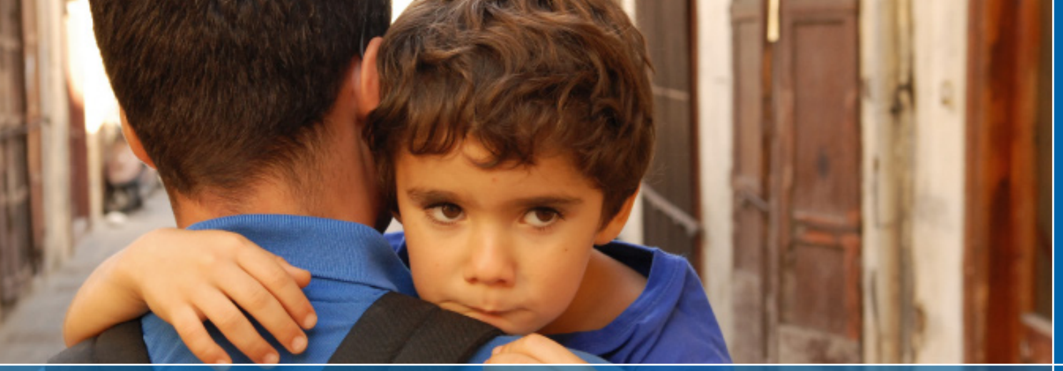
Caught Between Systems: The Intersection of Immigration and Child Welfare Policies