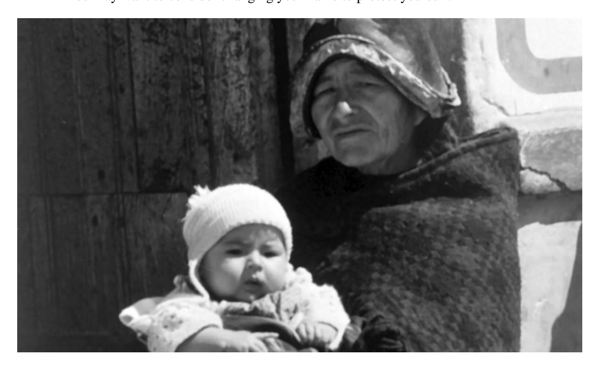
Empowering Survivors: Legal Rights of Immigrant Victims of Sexual Assault. Page 44

☐ You may want to consider changing your name to protect yourself.