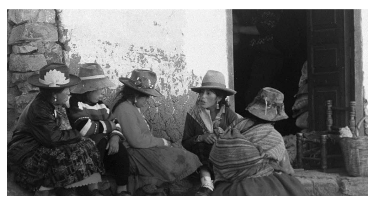
Empowering Survivors: Legal Rights of Immigrant Victims of Sexual Assault. Page 30