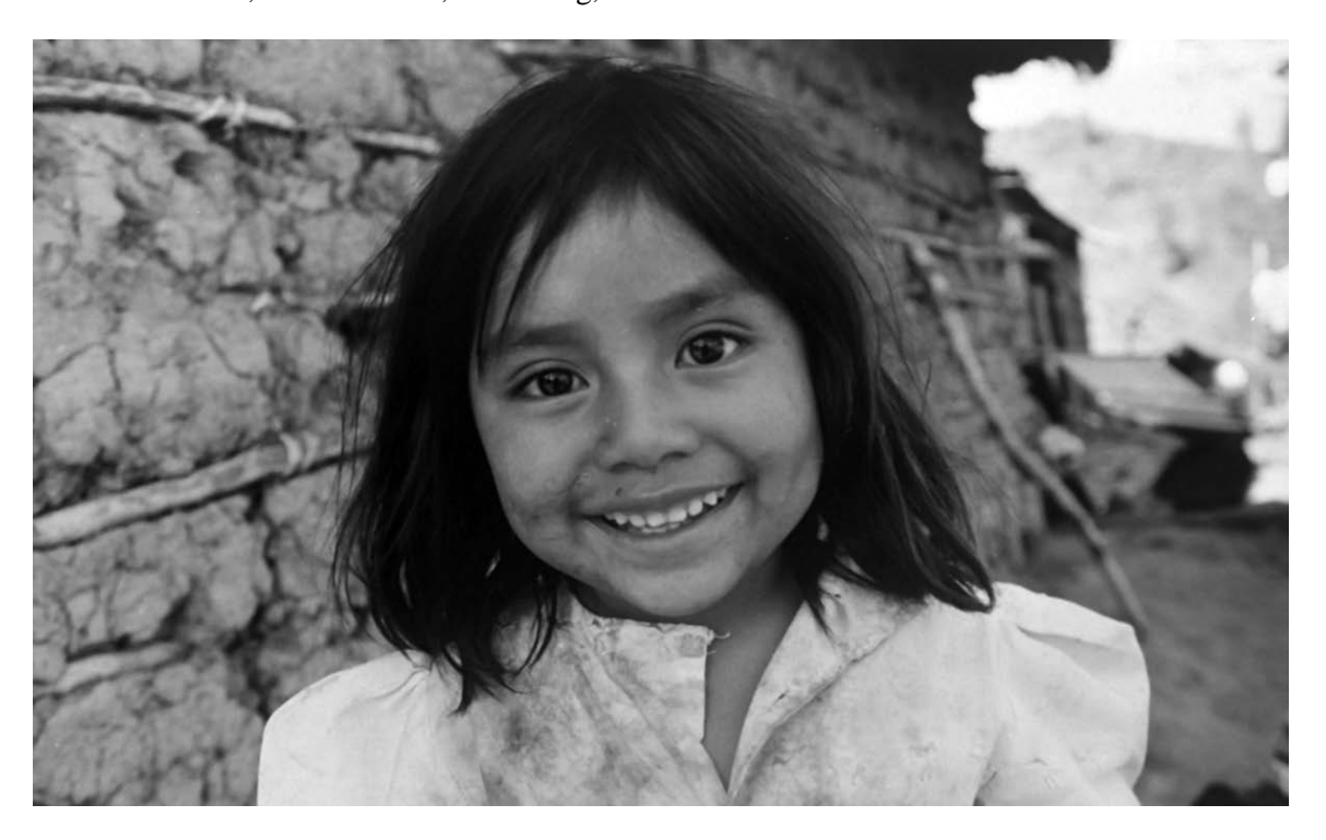
Empowering Survivors: Legal Rights of Immigrant Victims of Sexual Assault. Page 43